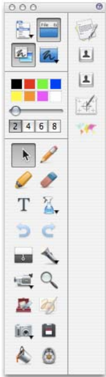
Tool Store – Presentation Mode (Extra customizable toolbar at the top of the page may also be turned on.)